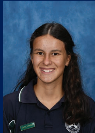
Calder House Captains