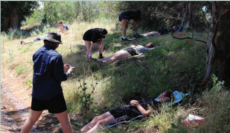
Students treat the 'casualties'.

After two days of intensive training, Year 9 students were assessed for their Wilderness First Aid certification on Wednesday. Passers-by would've been certain they'd stumbled upon a serious emergency as students role-played various first aid scenarios involving fake blood and pretend injuries in the bushland adjacent the staff carpark. The training was once again conducted by Neil Ritchie from Wilderness First Aid Australia. Neil commended the Year 9s on their attentiveness over the two days, and successfully putting all their new knowledge into practice in the final assessment.