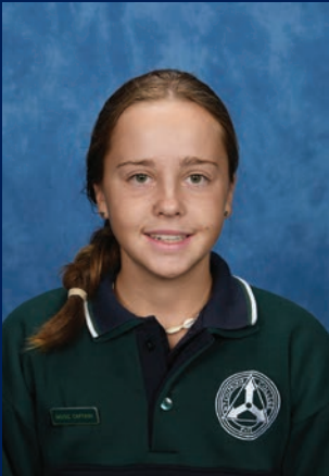
Broadway House Captains