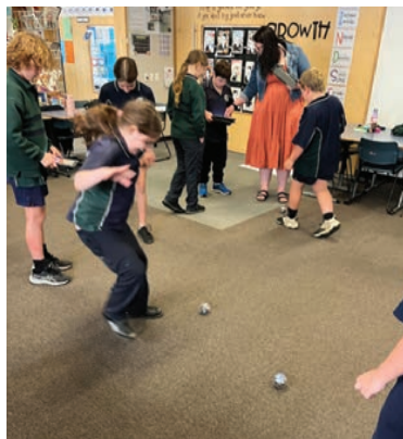
The Sphero robots in action.