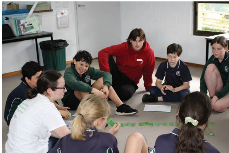
Year 5/6 students in a group activity during the Dream Seeds workshop. Dream Seeds is run by You thrive Victoria to help build aspiration and ease transition into secondary school.