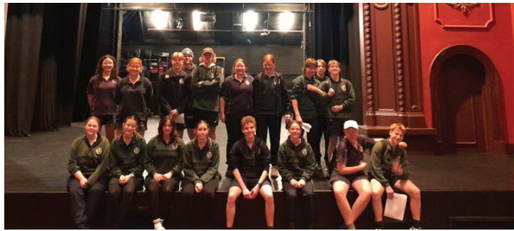
Visiting the Capital Theatre.