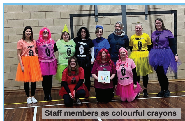
Staff members as colourful crayons