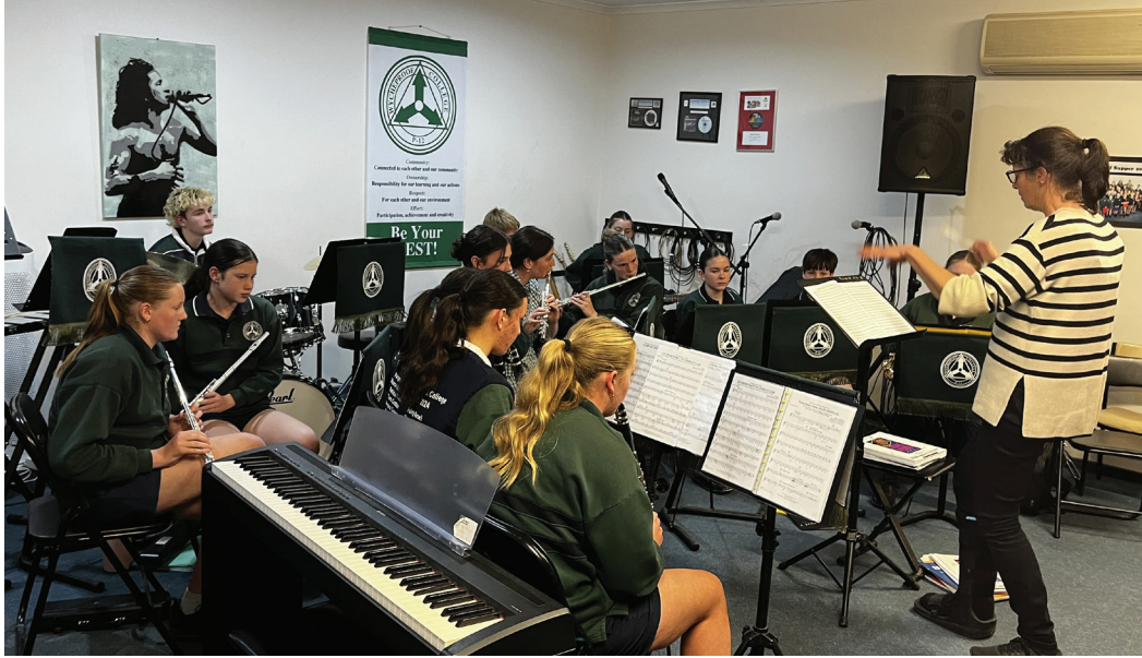
The Senior Concert Band performs at Solos & Suppers Concert on Wed, Sep 6.